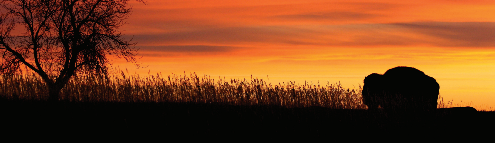
Silhouette of bison and tree at sunset, Theodore Roosevelt National Park, North Dakota