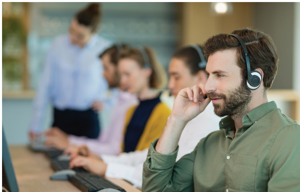
More in-depth information about customer experience is gathered through live interviews.

In addition to closed cases, customers with open cases at various milestones are randomly selected and surveyed. More current data is captured and changes can be made to improve the services to customers while cases are still open.